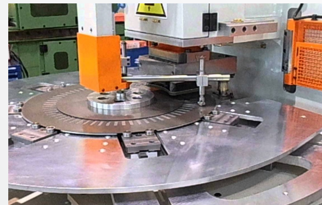
Notching tool with programmable die set