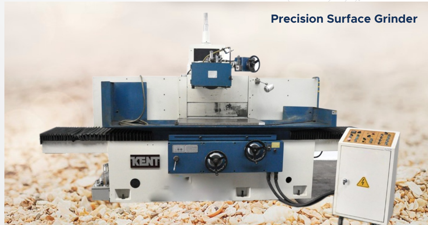
Precision Surface Grinder