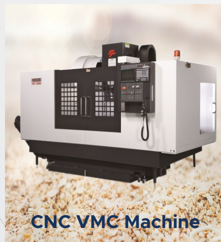
CNC VMC Machine