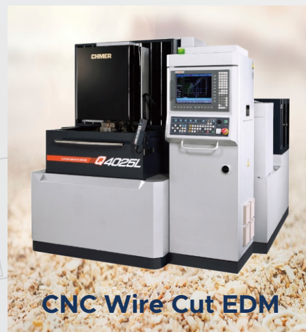
CNC Wire Cut EDM